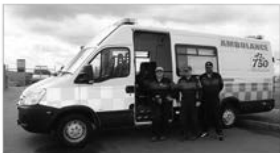
The Race Rescue Unit is one of the many Marshaling opportunities available