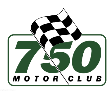
The Race Rescue Unit is one of the many Marshaling opportunities available