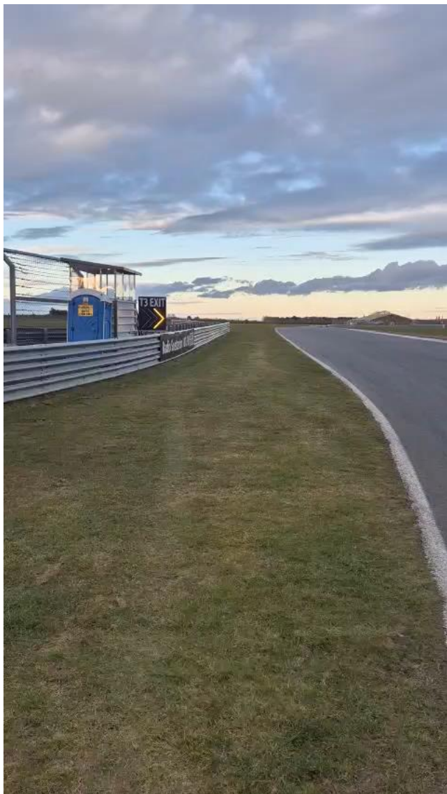
Sign on inside of Turn 3