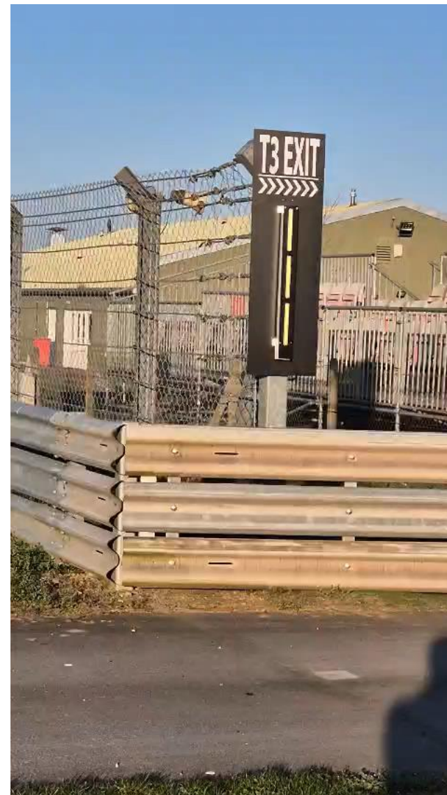
Sign at Turn 3 Exit