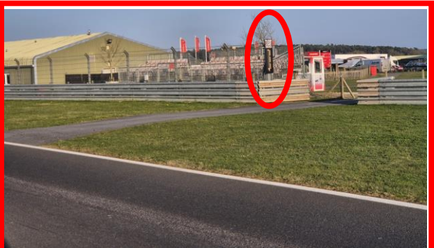
Lights on end of Debris Fence just passed Gate (Operated by Gatekeeper)