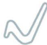
national 1.20 Miles