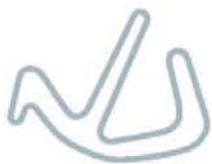
international gp 2.10 Miles