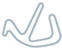
international gp 2.10 Miles