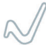
national 1.20 Miles